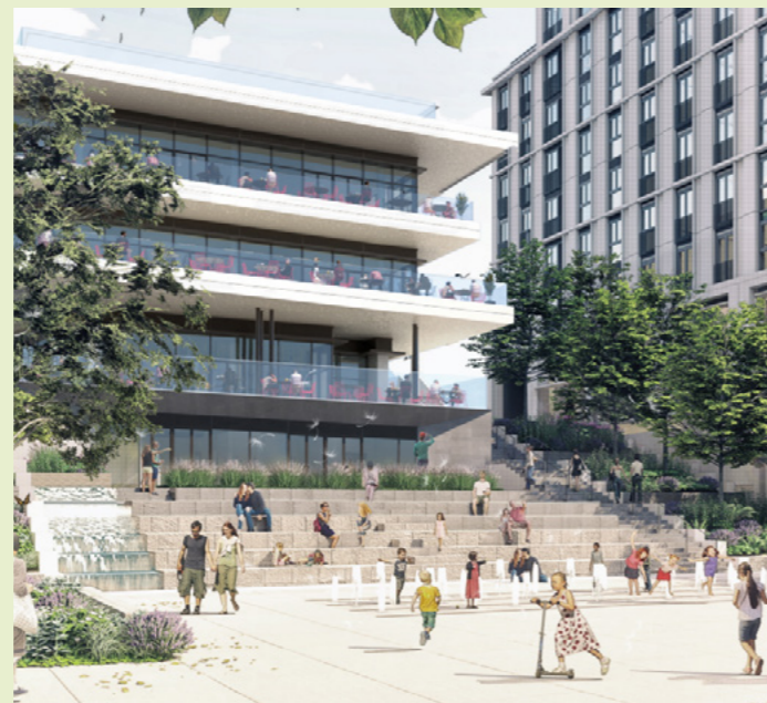
Image of completed development