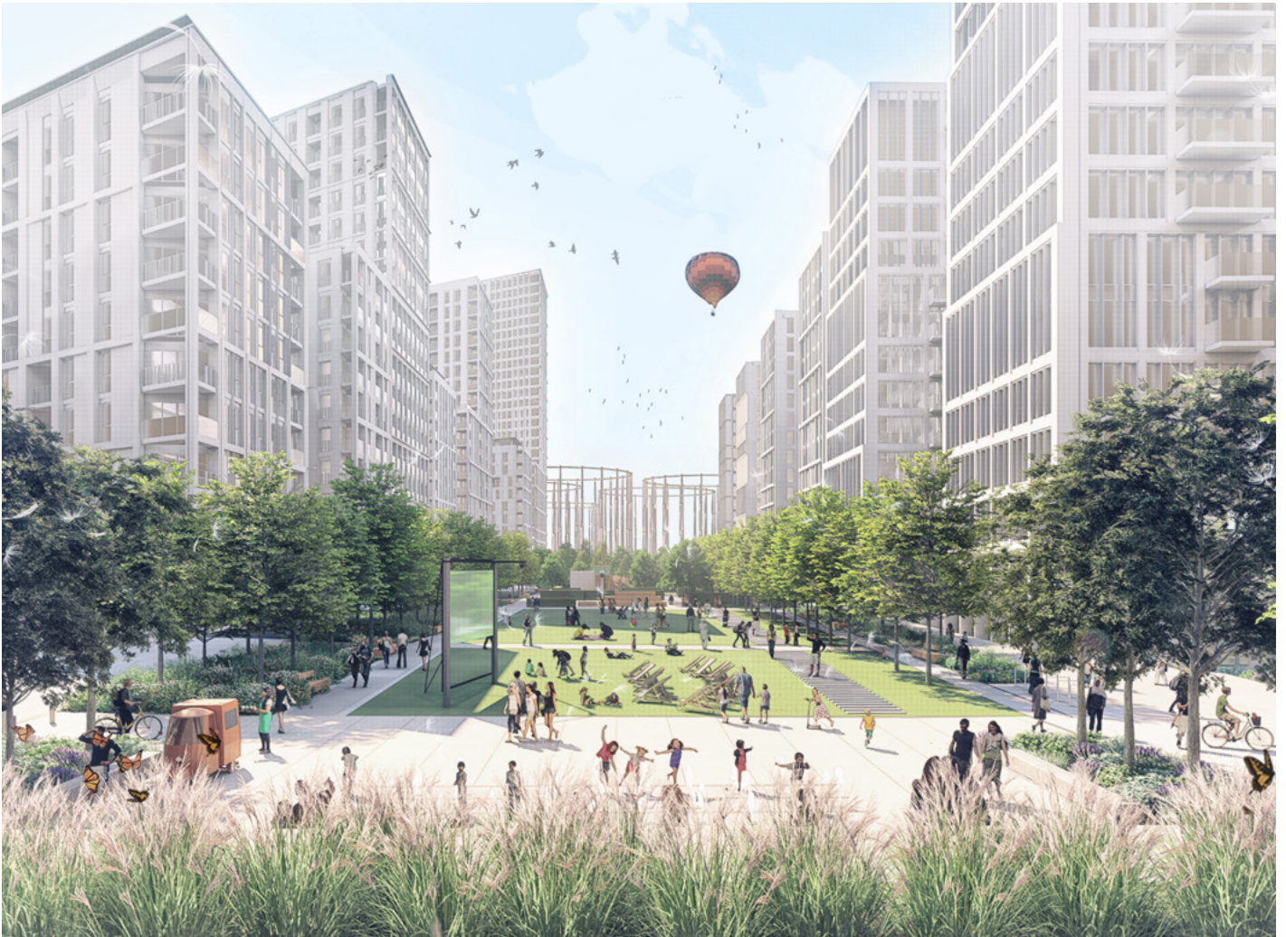
Image of completed development