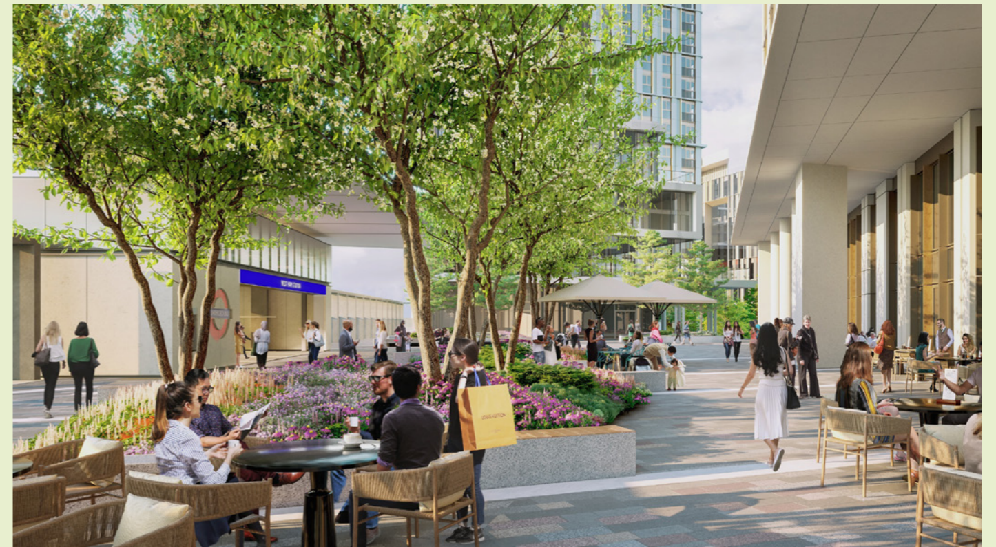
Image of completed development