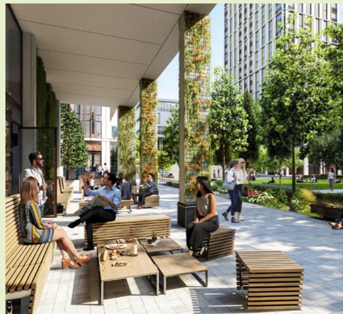
Image of completed development