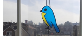
Some of the artwork created at the children's workshop