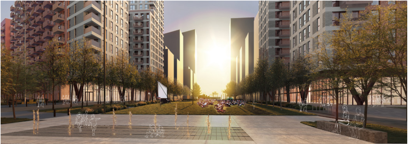
View from the podium area looking onto Four Seasons Park