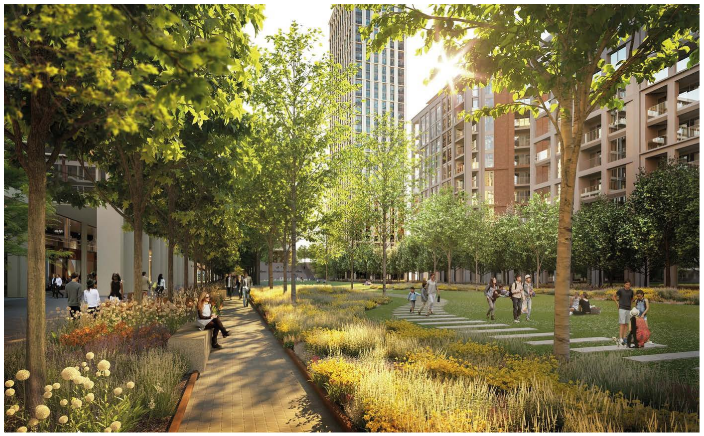
View of how open spaces in TwelveTrees Park could look on completion