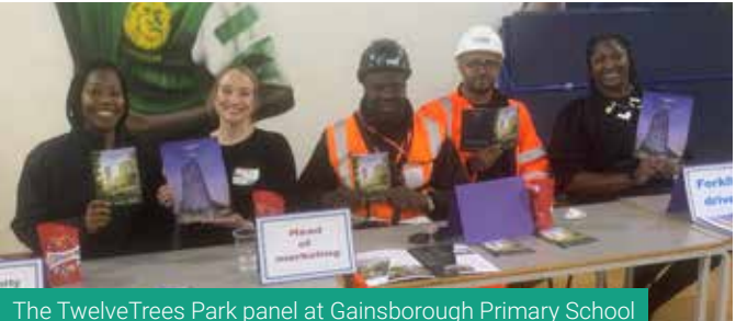
The Twelve nees Faik panel at Gainsborough Fhimary School

The TwelveTrees Park team recently went to Gainsborough Primary School to talk to the pupils about the different roles in the construction industry to get them thinking about different careers. It was great to talk to over 120 of the children there and we hope to see some of them in the industry in the years to come!