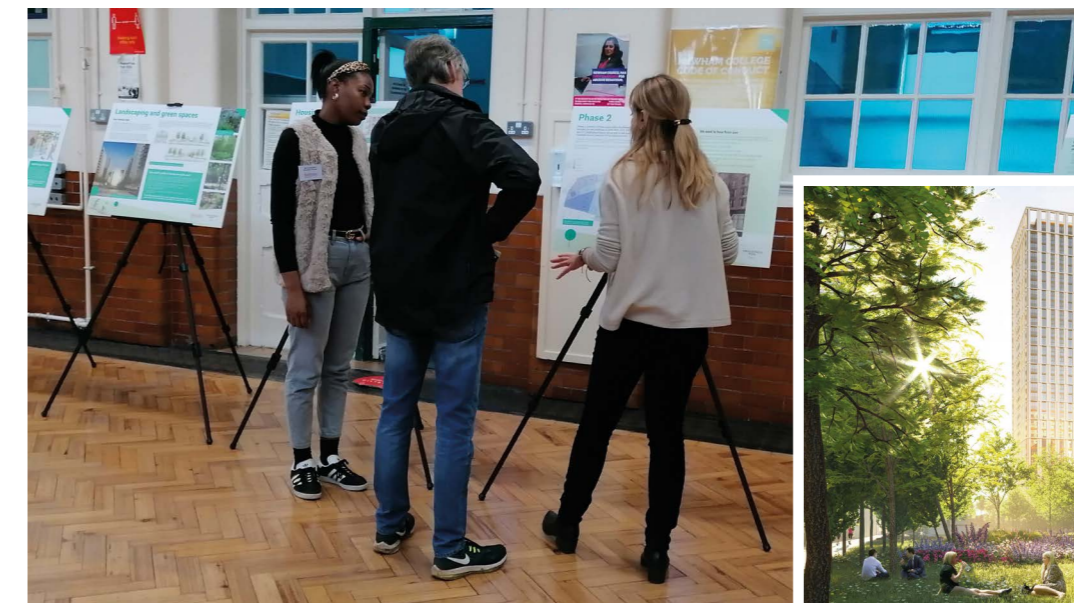
Image from our Phase 2 consultation event earlier this year