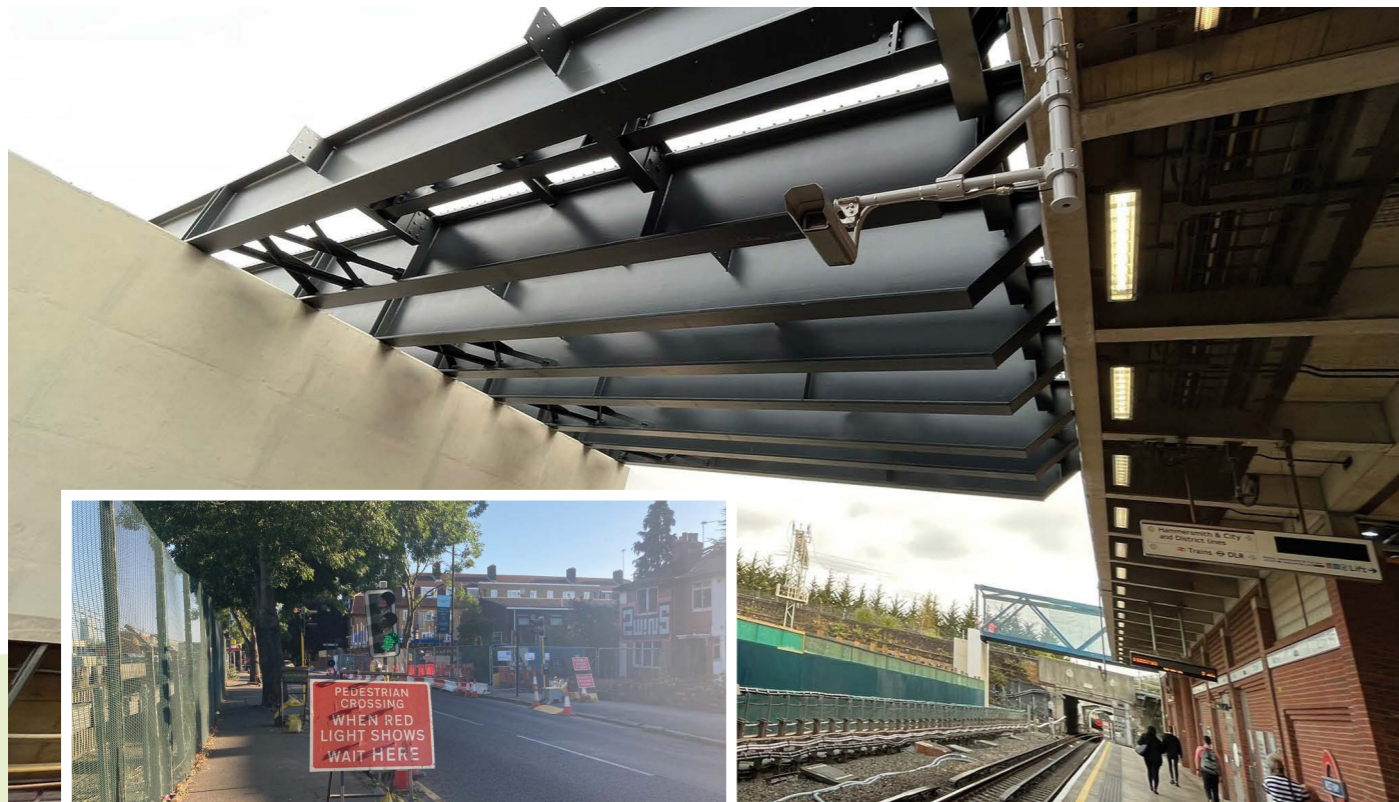
Image of the newly installed station entrance bridge

Thank you for all the feedback you've submitted and for keeping engaged on the project. We will let you know when the application is submitted, which should be within the next four weeks, and details of how you can share any further comments with the Council.