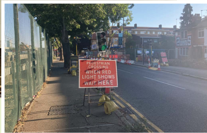
Pedestrian crossing installed on Milner Road