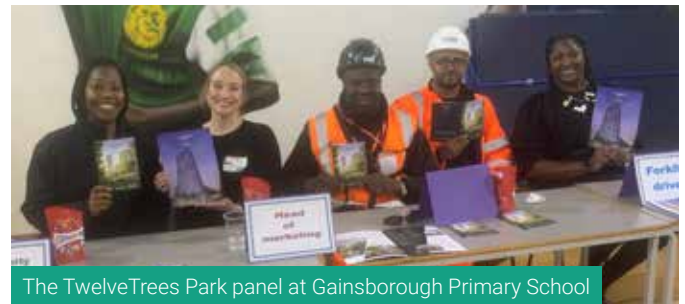
The TwelveTrees Park panel at Gainsborough Primary School

The TwelveTrees Park team recently went to Gainsborough Primary School to talk to the pupils about the different roles in the construction industry to get them thinking about different careers. It was great to talk to over 120 of the children there and we hope to see some of them in the industry in the years to come!